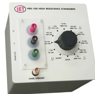
A series of HRRS High-Voltage Substituter Standards customized as a single decade.