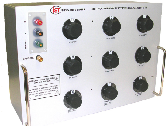
HRRS 9-Decade High-Voltage Substituter