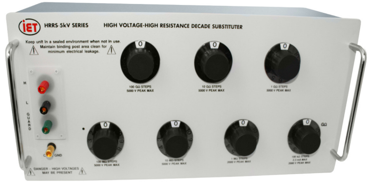
HRRS 7-Decade High-Voltage Substituter